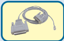
RS-232 Serial Communication Cable