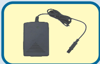
24V DC, 1.7A Power Adapter