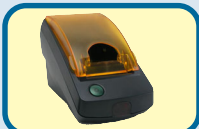
DSA-3100P Ticket Printer with Paper Roll