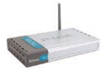
DI-624 Wireless Router

Other D-Link products that work with the DCM-202: