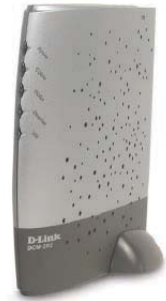
DCM-202 High-Speed DOCSIS 2.0 Cable Modem

The DCM-202 works seamlessly with other D-Link wired or wireless networking products and networking products you may already own. Connecting your DCM-202 to a D-Link Router will let you share your broadband connection with other computers and peripherals.