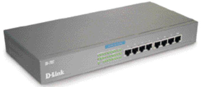
DI-707 7-Port Switched Fast Ethernet Broadband For Home and Small Business Gateway

The D-Link DI-707 strictly adheres to IEEE standards, and is compatible with existing network technology. The seven (7) 10/100 Mbps ports adhere to IEEE 802.3 and IEEE 802.3u, which specify 10BASE-T and 100BASE-TX Ethernet technology respectively, and use NWay auto-negotiation to switch between 10Mbps and 100Mbps speeds. The seven 10/100 Ethernet ports use layer 2 switching technology to minimize packet broadcast, greatly enhancing the speed and productivity of the LAN. Each port also adheres to the IEEE 802.3x standard, which specifies Flow Control support for full-duplex Ethernet ports.