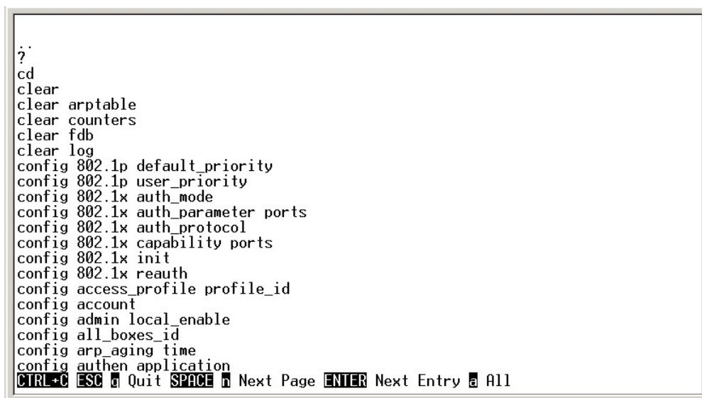
Figure 2-2. The ? Command

There are a number of helpful features included in the CLI. Entering the ? command will display a list of all of the top-level commands.