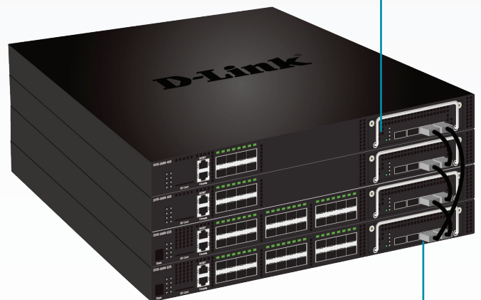
DEM-CB100QXS/300QXS, the 40G QSFP+ to QSFP+ DAC