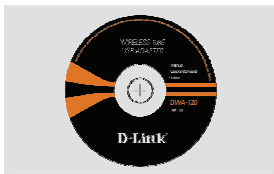
CD-ROM (Installation CD, Manual and Warranty)