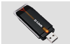
DWA-120 Wireless 108G USB Adapter

If any of the items are missing, please contact your reseller.